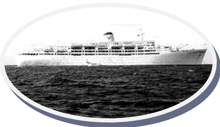
The troop carrier, Oxfordshire, refitted as a passenger liner and renamed Fairstar in 1964.